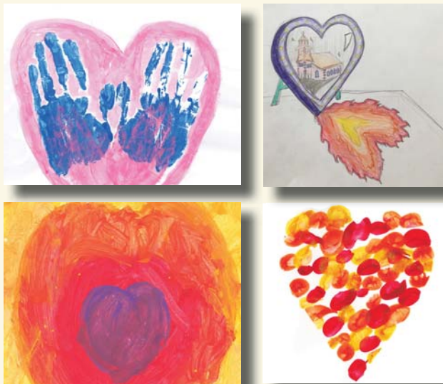
ART COURTESY OF CHILDREN AND YOUTH OF SOUTH MAIN.

We are now accepting donations toward our annual Missions Offering that will culminate on Pentecost Sunday, May 20, 2018. Our goal is to raise $125,000 that we can give to our Mission Partners here and across the world.