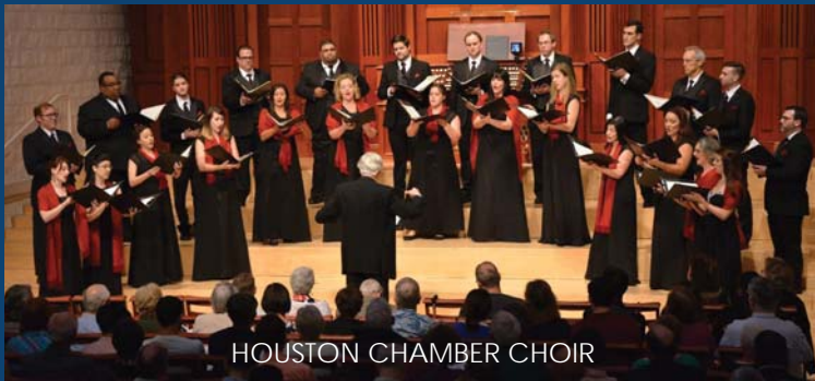
HOUSTON CHAMBER CHOIR

South Main members receive a 35% discount on tickets using the code SMBC35 at houstonchamberchoir.org .